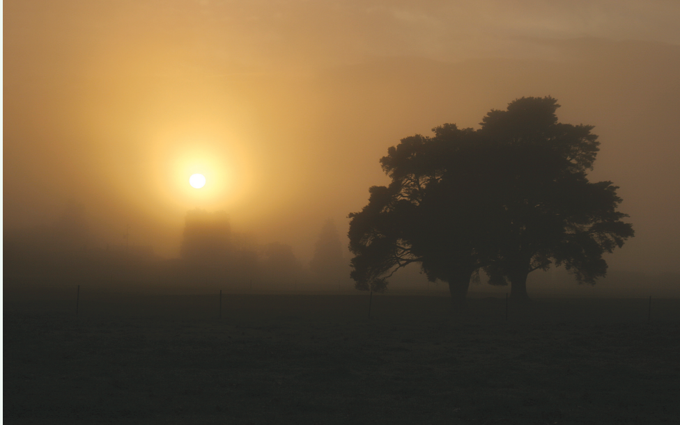
Totara silhouetted on a misty morning