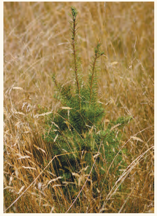
Douglas fir struggling on a thick grass pasture. Planted 2004. 3 years.