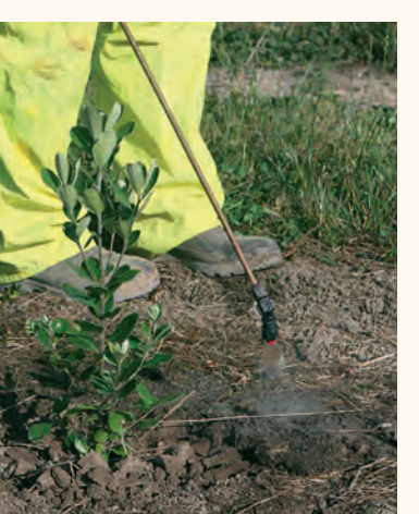
Mulch keeps herbicide away from foliage