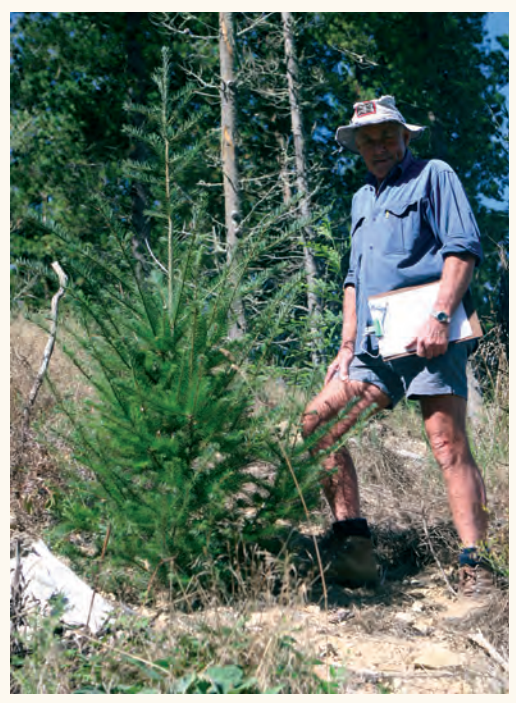
Excellent weed control and fertiliser. Douglas fir 2/0 planted 2005. 2 years.