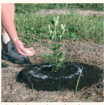
Nitrophoska spread away from the stem

Contact your local fertiliser company representatives for soil testing and fertiliser recommendations.