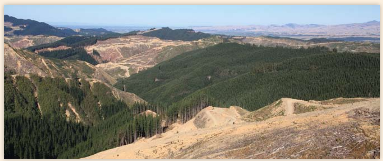
Nelson Forests north bank, Marlborough harvesting operations.

Looking forward, we have such continued confidence in the industry that we have been preparing tracking and spraying for a new joint venture. Douglas fir will be planted next winter in a higher rainfall area, which is quite different to our previous experience, but makes it all the more interesting.