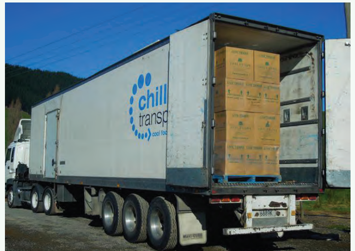
Refrigerated Transport. Rapid & reliable delivery nationwide