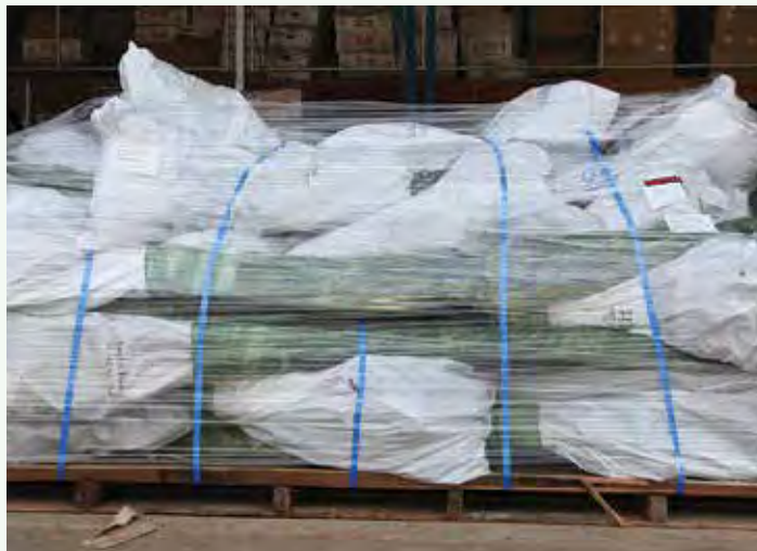
Bulk pallet load